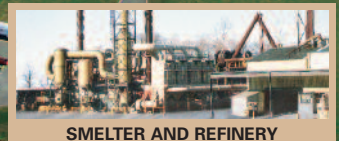
SMELTER AND REFINERY