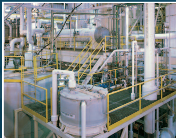
Wastewater Treatment Plant

The company's modern facilities as well as its long-standing "green" culture has made East Penn the most environmentally conscious proactive battery manufacturer, and recycler in the world.