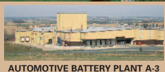
AUTOMOTIVE BATTERY PLANT A-3